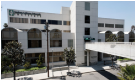
Van Nuys, CA

SCOI's Center for Orthopedic Surgery is a state-of-the-art surgical facility designed to facilitate the treatment of patients with musculoskeletal injuries and disorders. They are a fully licensed and AAAHC-accredited ambulatory surgery center, that has pioneered the development of arthroscopic surgical procedures, particularly in the shoulder, wrist and ankle. Additionally, the entire spectrum of outpatient orthopedic surgical procedures are performed, including elbow, hand, knee and foot.