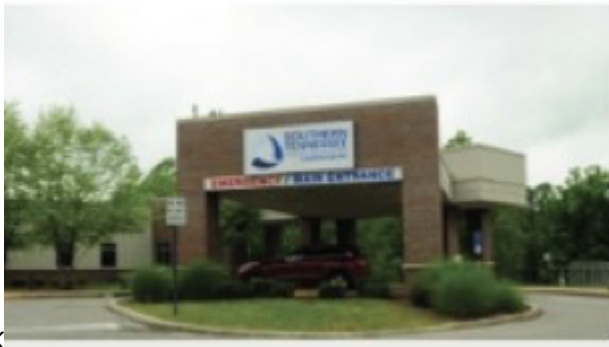
Oklahoma City, OK

The Bone and Joint Hospital at St. Anthony is unique in that the hospital, physicians, and other health care professionals are committed solely to orthopedic care. Their staff offers a range of orthopedic services including hip and knee replacement, spine surgery, pain management, sports medicine, arthroscopic procedures, foot and ankle surgery, hand surgery, and robotic surgery. There are 54 beds. The Bone and Joint Hospital at St. Anthony is a Center of Excellence for total joint replacement and is a CRNA-only hospital-employed group supervised by the operating surgeon.